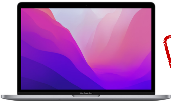
MACBOOK PRO 13"

WE APPRECIATE ALL YOU DO TO HELP US GROW SUMMIT FAMILY DENTAL