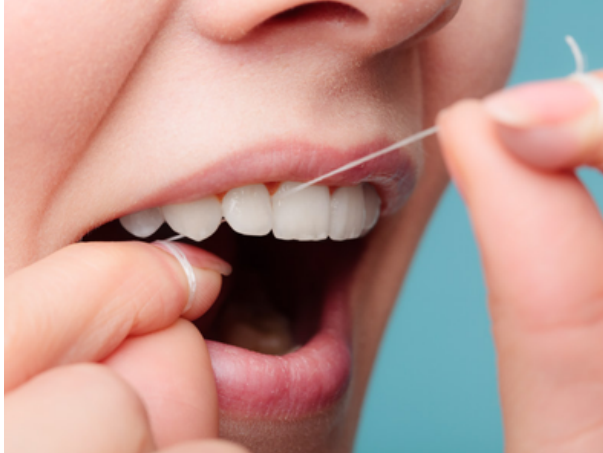
Karyn Casey RDH

loosen the debris that string floss is difficult to reach. Additionally, these instruments are great for preventing gum disease; they clean gum pockets that floss may be unable to get. They serve a need specifically for gum health that traditional floss does not fulfill. Many patients wonder if an air flosser or water flosser can replace manual string flossing or even brushing! However, most dentists and dental hygienists still value regular string flossing. They recommend string flossing even with an air or water flosser. String flossing physically scrapes the tooth to remove plaque; no other technology can beat that scraping motion. Of course, the best flossing tool will be the one you will actually use daily. But, all professionals agree that neither the water nor the air flosser takes